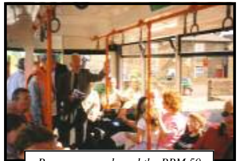
Passengers on board the PPM 50 railcar as it departs Leeming Bar

A press launch before the start of public services resulted in national and regional coverage in print, on radio and on television.