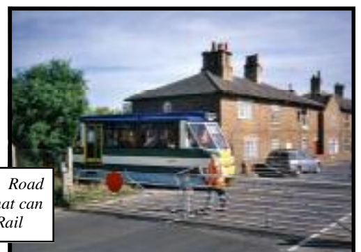
The PPM Light Railcar at Leeming Bar. Road crossings are a feature of 'heavy rail' that can be simplified with Community Light Rail