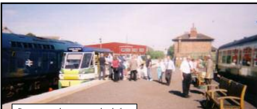
Passengers and reporters on the platform at Leeming Bar during the press launch day on 12th September. The WR's diesel trains to Redmire served the same platform to provide the simplest of connections

From the very first day of passenger operation - Thursday 15th September - residents and visitors to the Dales started using the combined rail and bus service to reach shops, services and rail connections at Northallerton. Over 700 passenger journeys were made on the light railcar during the eight days of demonstration service.